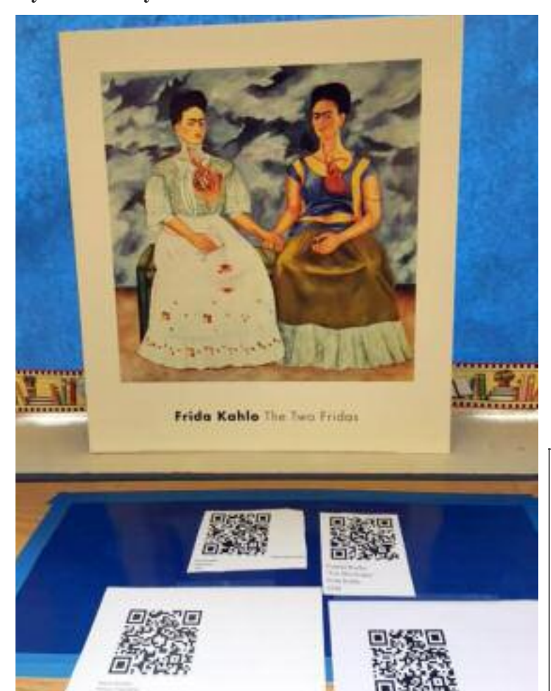
One of the 35 replica paintings by Spanish-speaking artists, along with its QR codes, recently on display at the Acalanes High School library